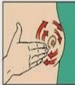
3. Stand and press your fingers on your breast, working around the breast in a circular direction.