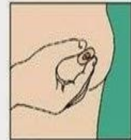
5. Squeeze your nipples to check for discharge. Check under the nipple last.