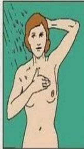
1. Examine your breasts in the shower.