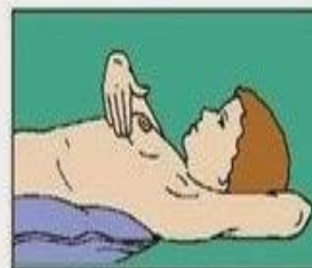
4. Lie down and repeat step 3.