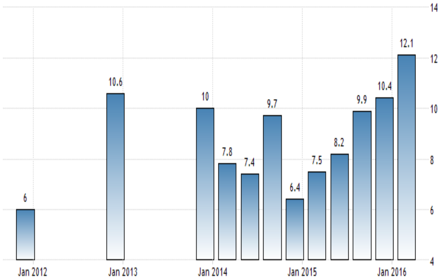
NIGERIA UNEMPLOYMENT RATE