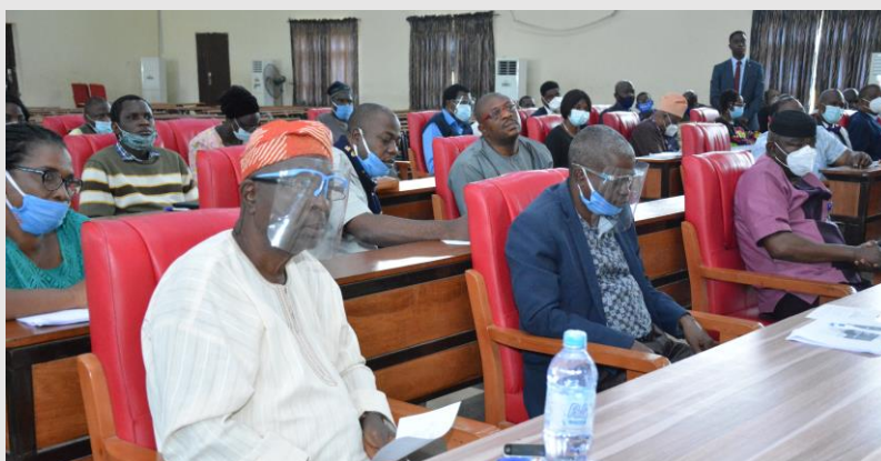
A cross-section of participants at the Strategic Planning workshop

He said for the University to develop a good strategic plan, there is need to carry-out SWOT analysis and identify the Strengths, Weaknesses, Opportunities and Threats of the institution.