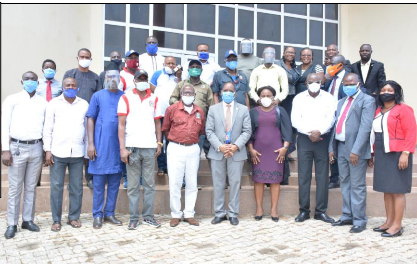
A group photograph of executive members of SSANU with Principal Officers of the University of Medical Sciences, UNIMED, Ondo.