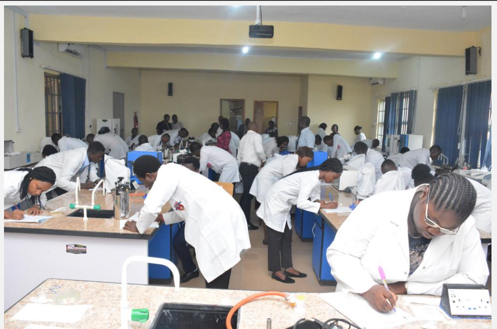
UNIMED students writing exam