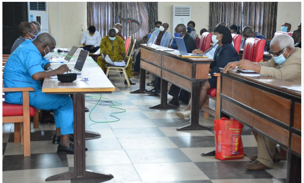
A cross-section Senate members during the 10 th Special meeting at the Main Auditorium, University of Medical Sciences, (UNIMED), Odosida Campus, Ondo.