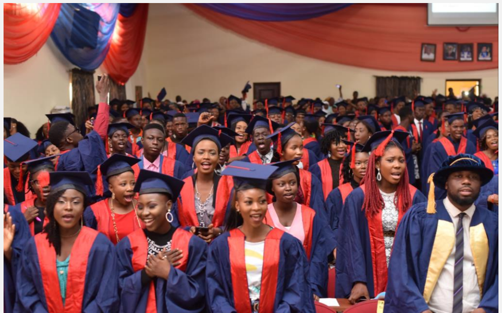
UNIMED students during the 5th matriculation ceremony

He said, "This 'new normal' approach will reduce student's loss of time, keep them engaged in a directed lifelong learning