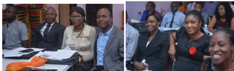
Participants during the capacity building workshop